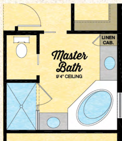
Available Master Bath Variation